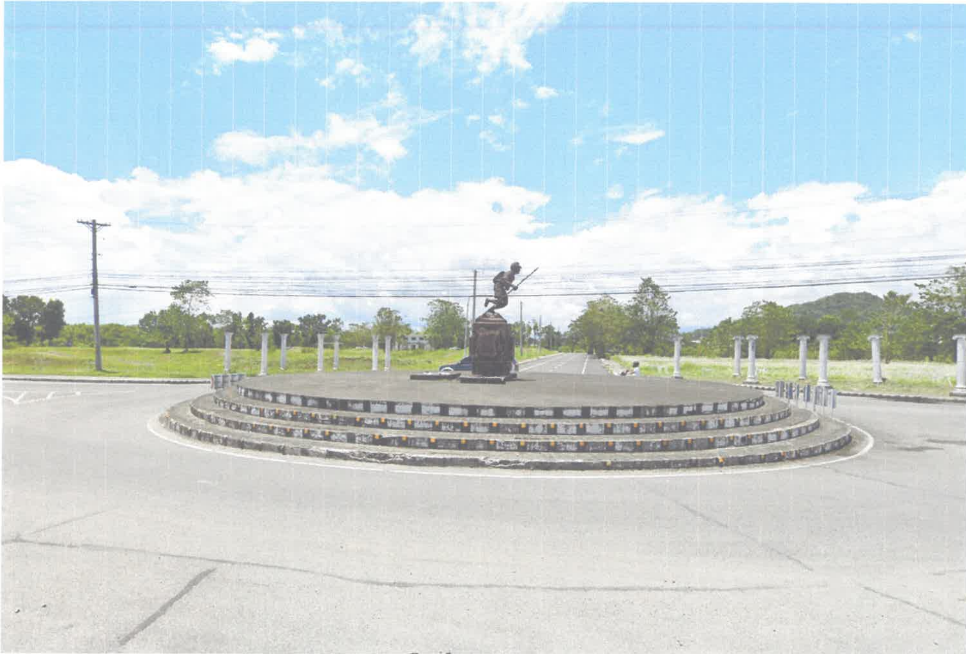
Existing Site Condition - Rotunda MacArthur Landing Memorial National Park