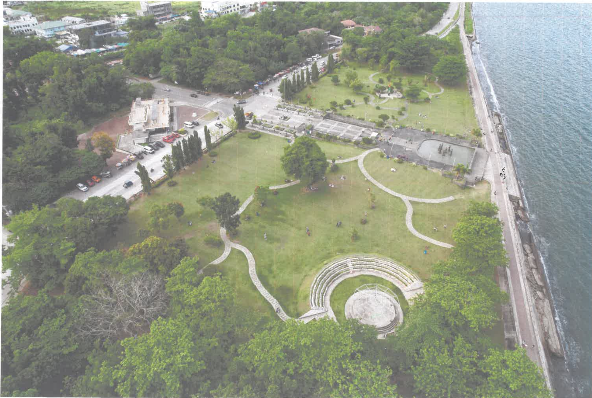
Existing Site Condition MacArthur Landing Memorial National Park