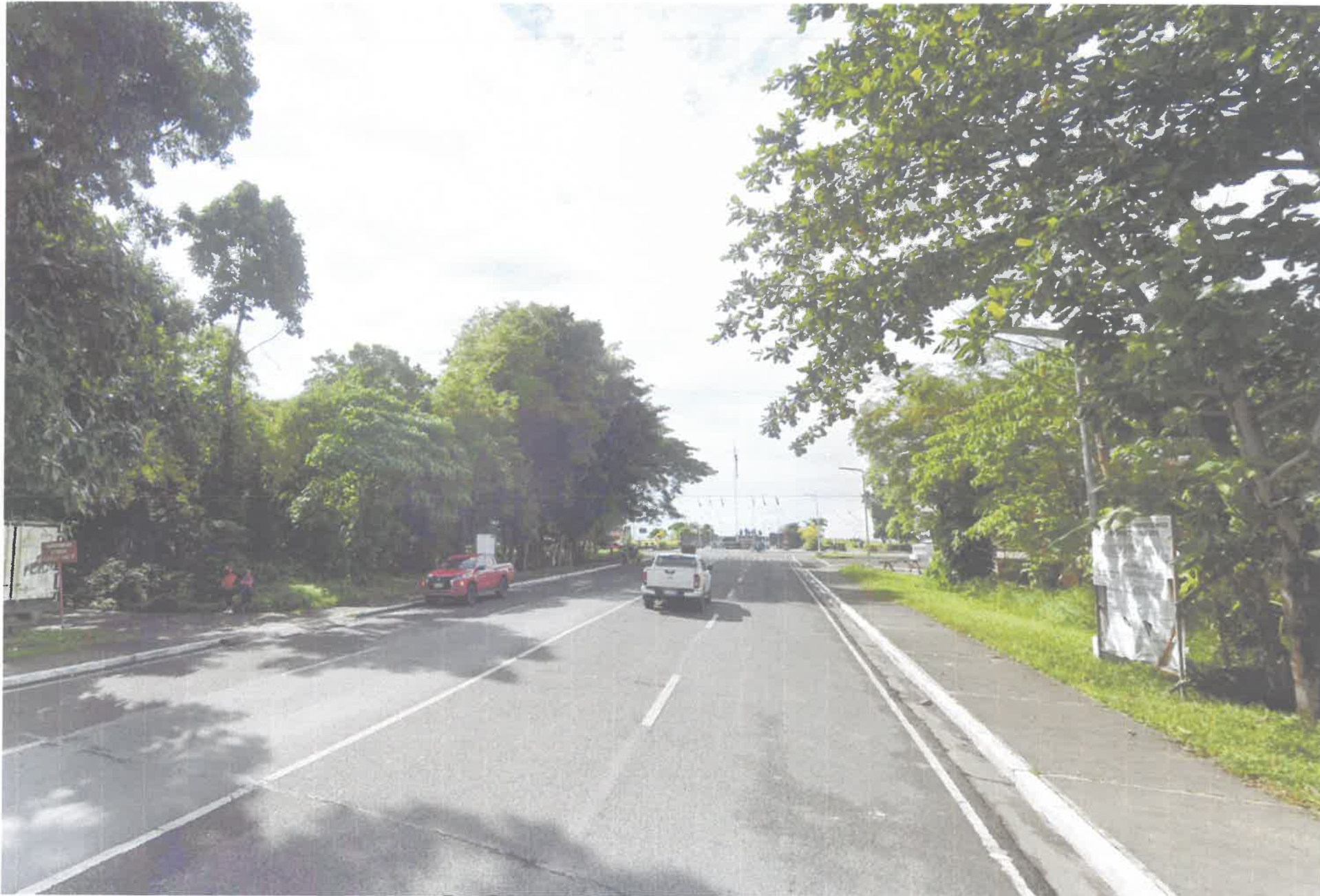
Existing Site Condition – Maharlika Highway MacArthur Landing Memorial National Park