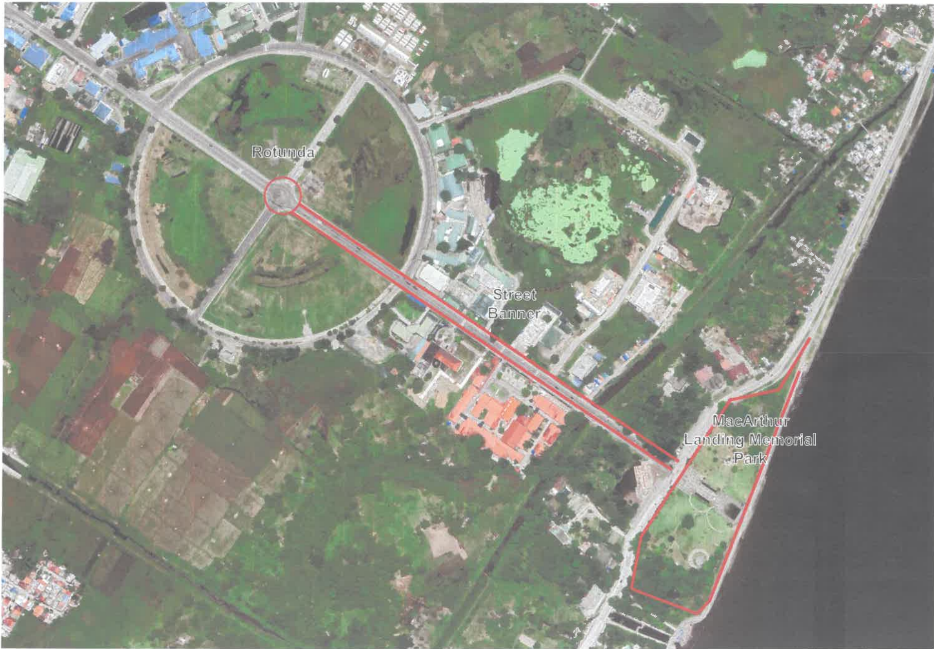
Existing Site Condition MacArthur Landing Memorial Park