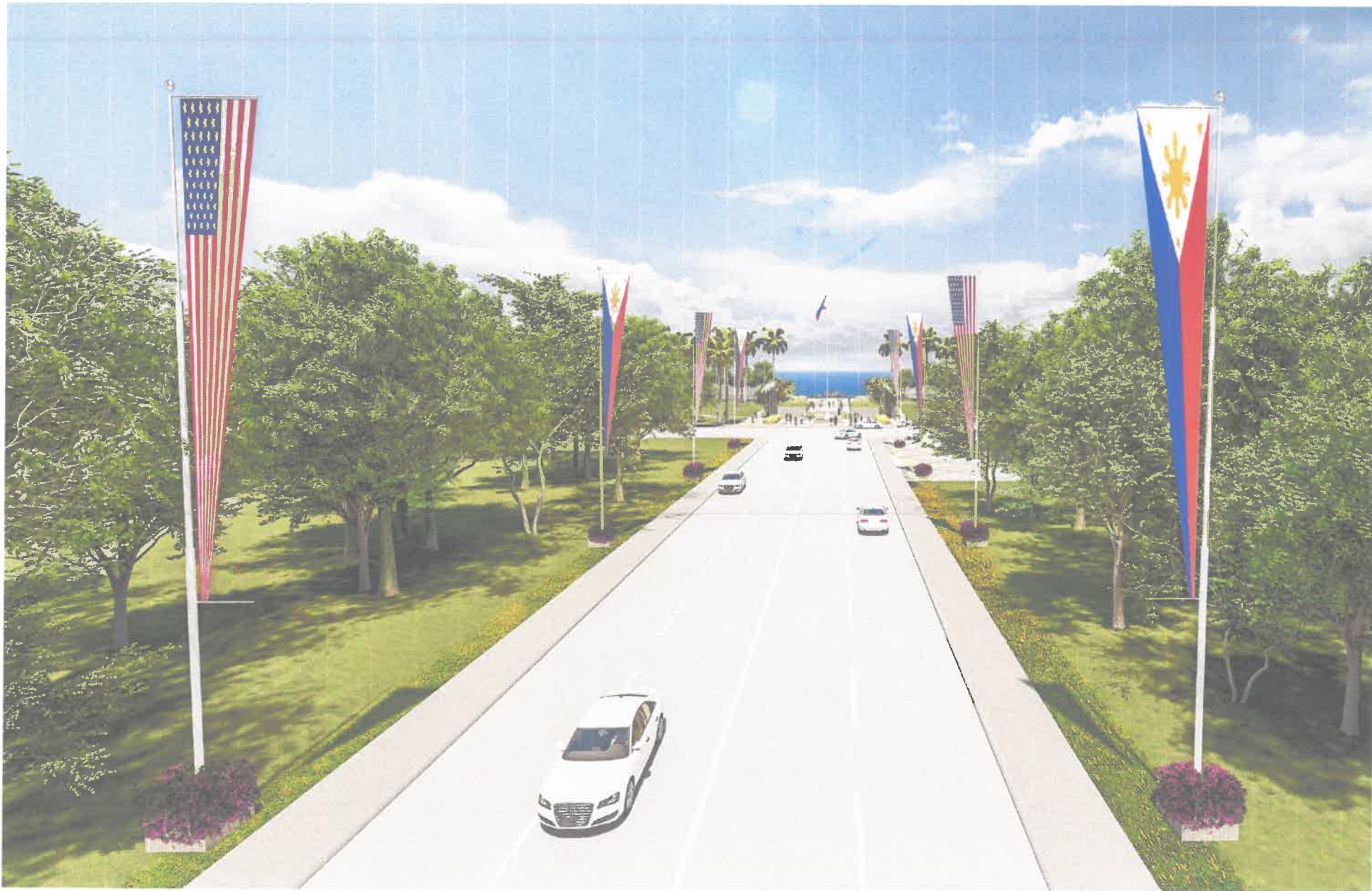
Perspective – Maharlika Highway MacArthur Landing Memorial National Park