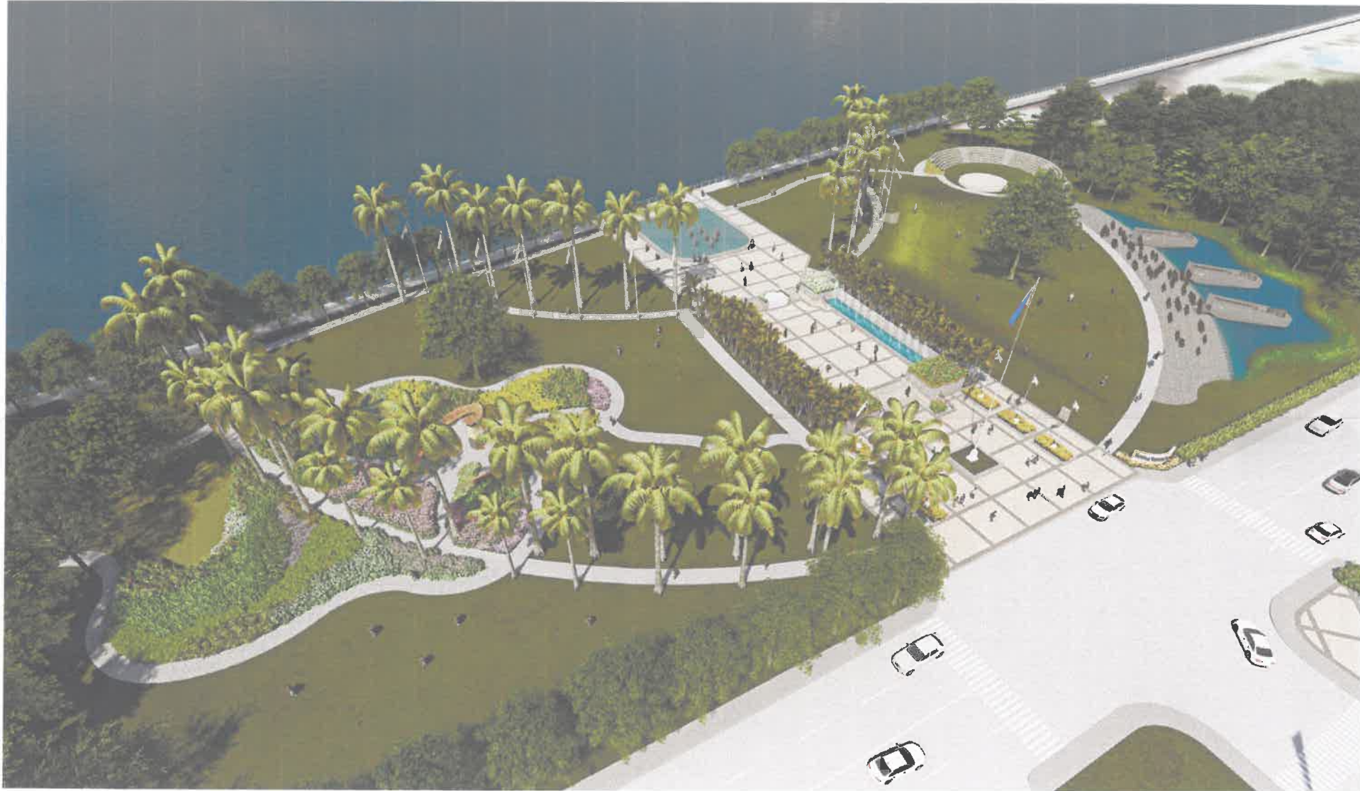
Perspective MacArthur Landing Memorial National Park