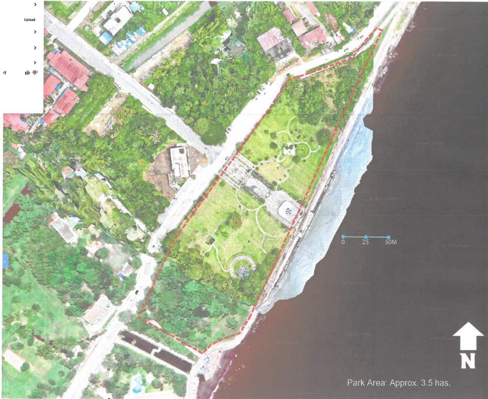
Existing Site Condition MacArthur Landing Memorial Park