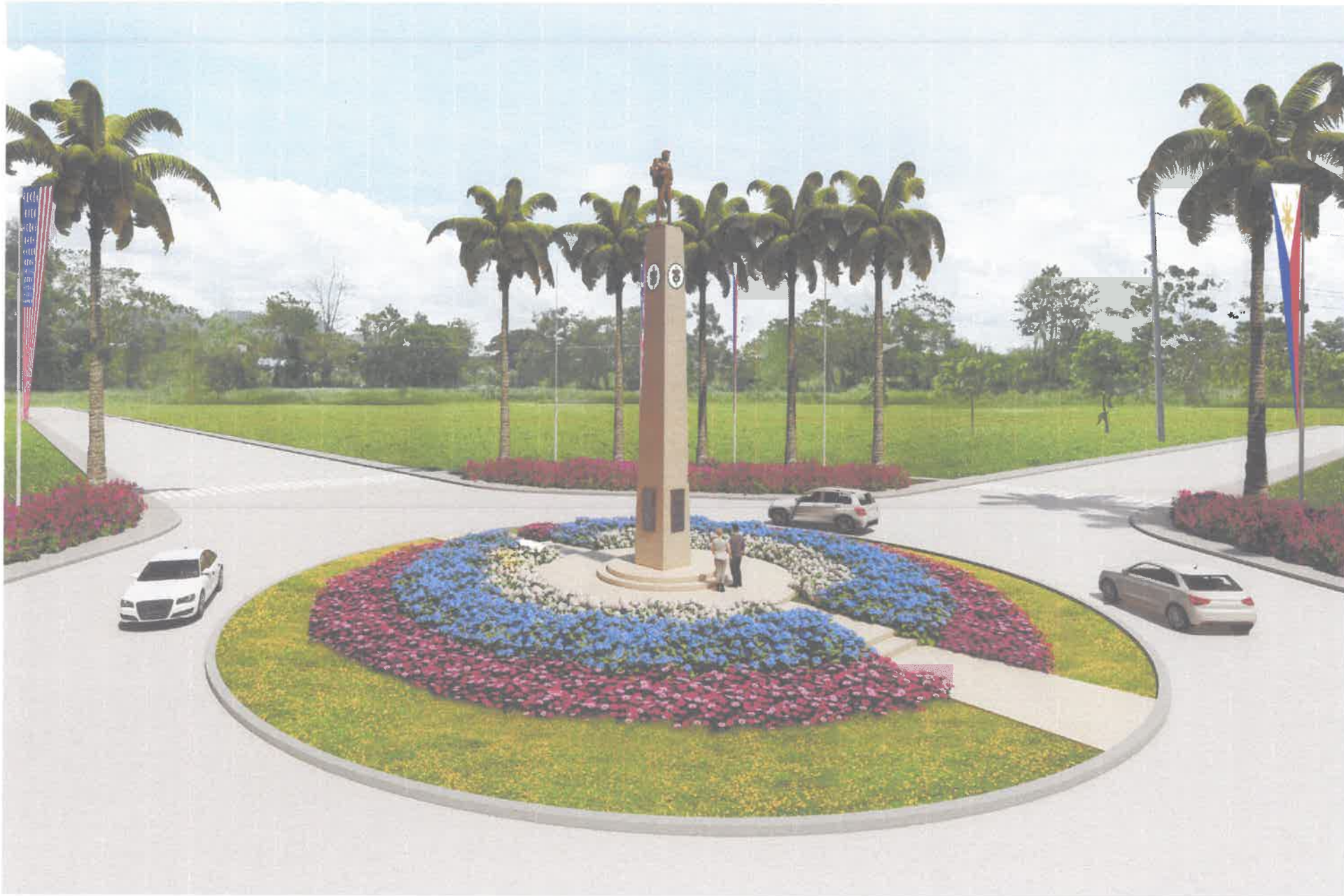
Perspective - Rotunda MacArthur Landing Memorial National Park