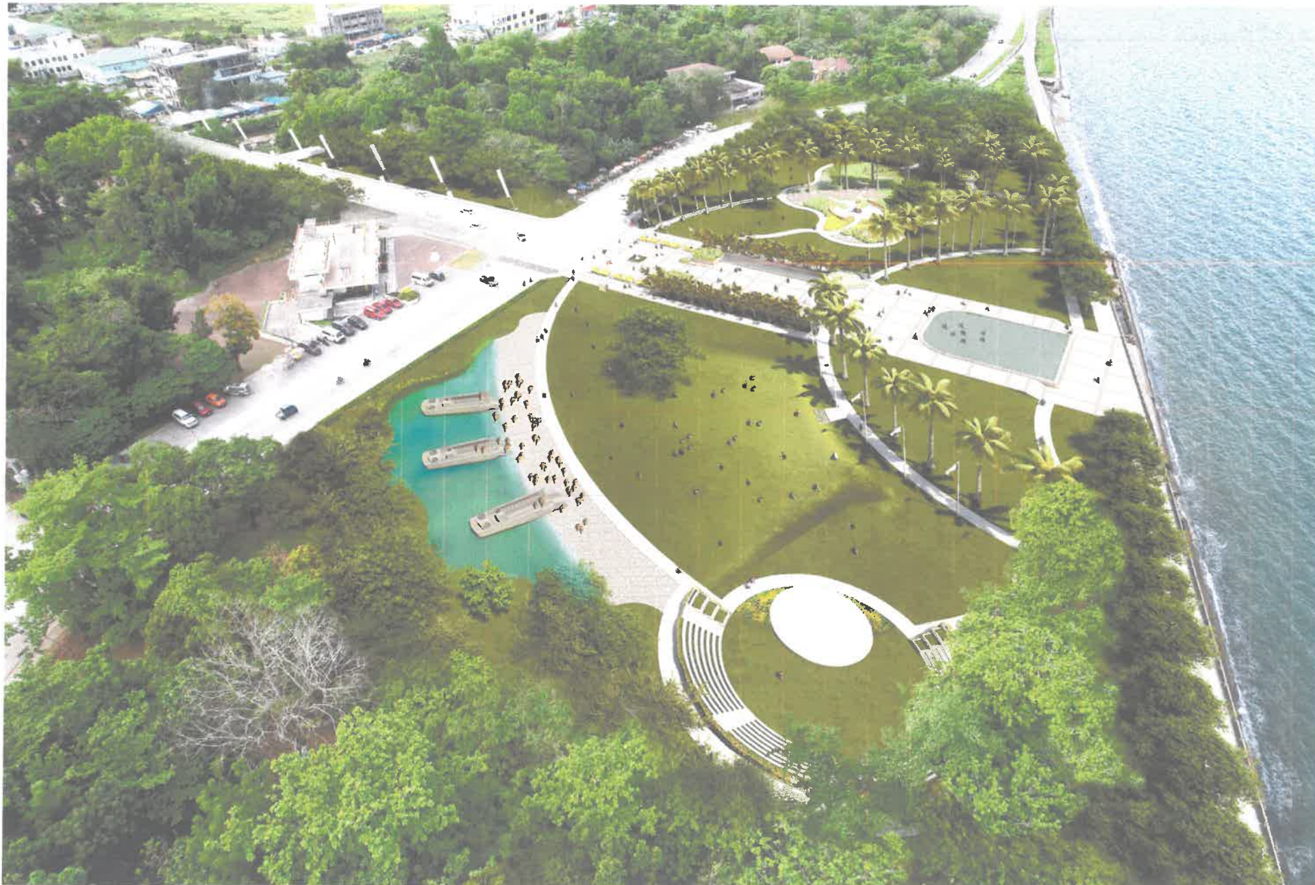
Perspective MacArthur Landing Memorial National Park