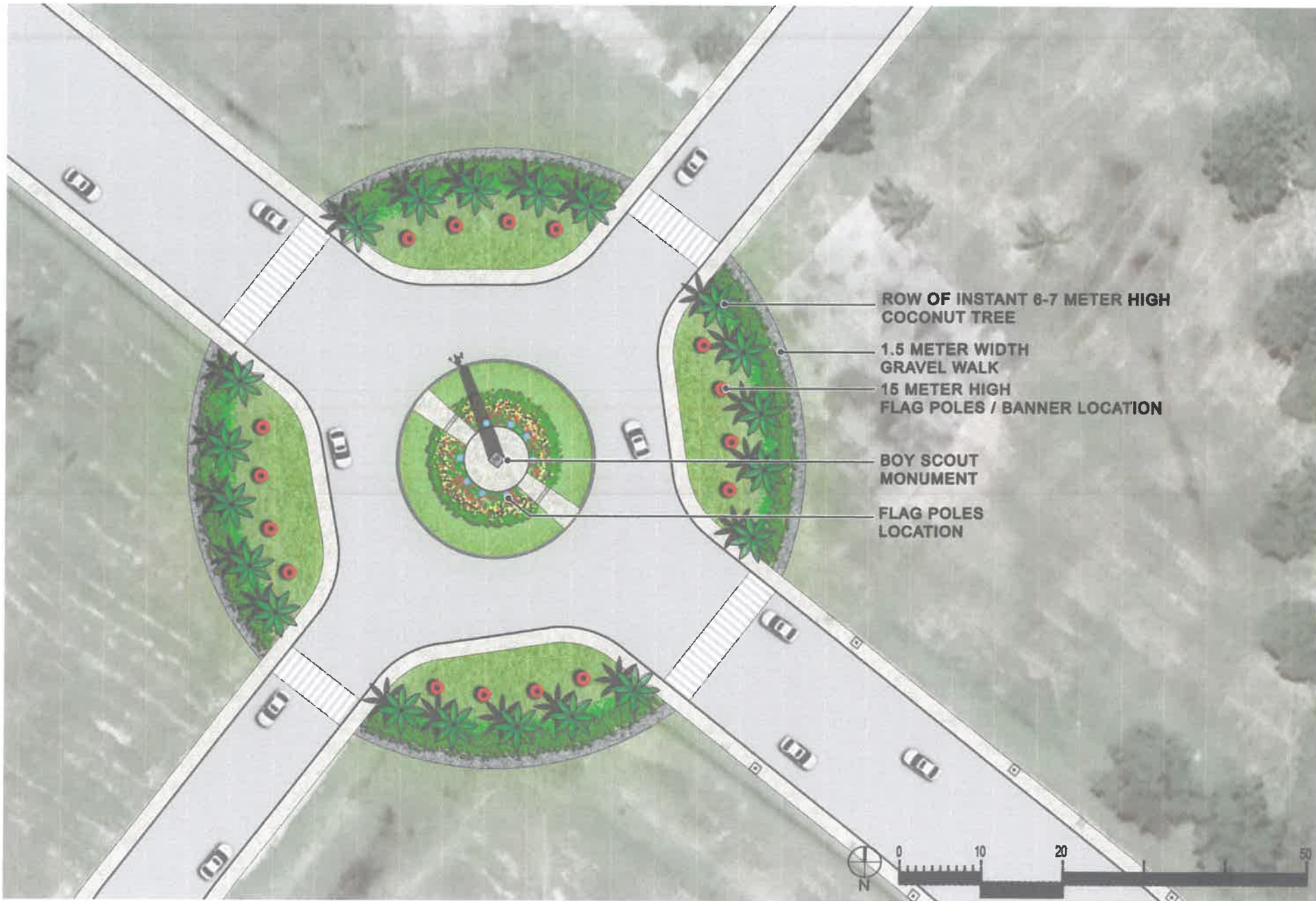
Proposed Site Development Plan – Rotunda MacArthur Landing Memorial National Park